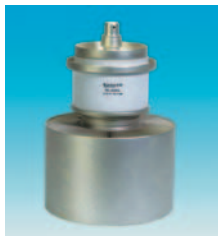
RS 3080 CL

The RS 3080 CL is a RF power triode designed specifically for industrial applications. This tube uses a coaxial design and metal-ceramic technology. This triode is designed to operate in CW mode. For operation in pulse mode, the parameters depend on each